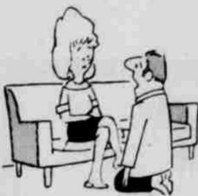
"How much do I make a week... that's no answer!"