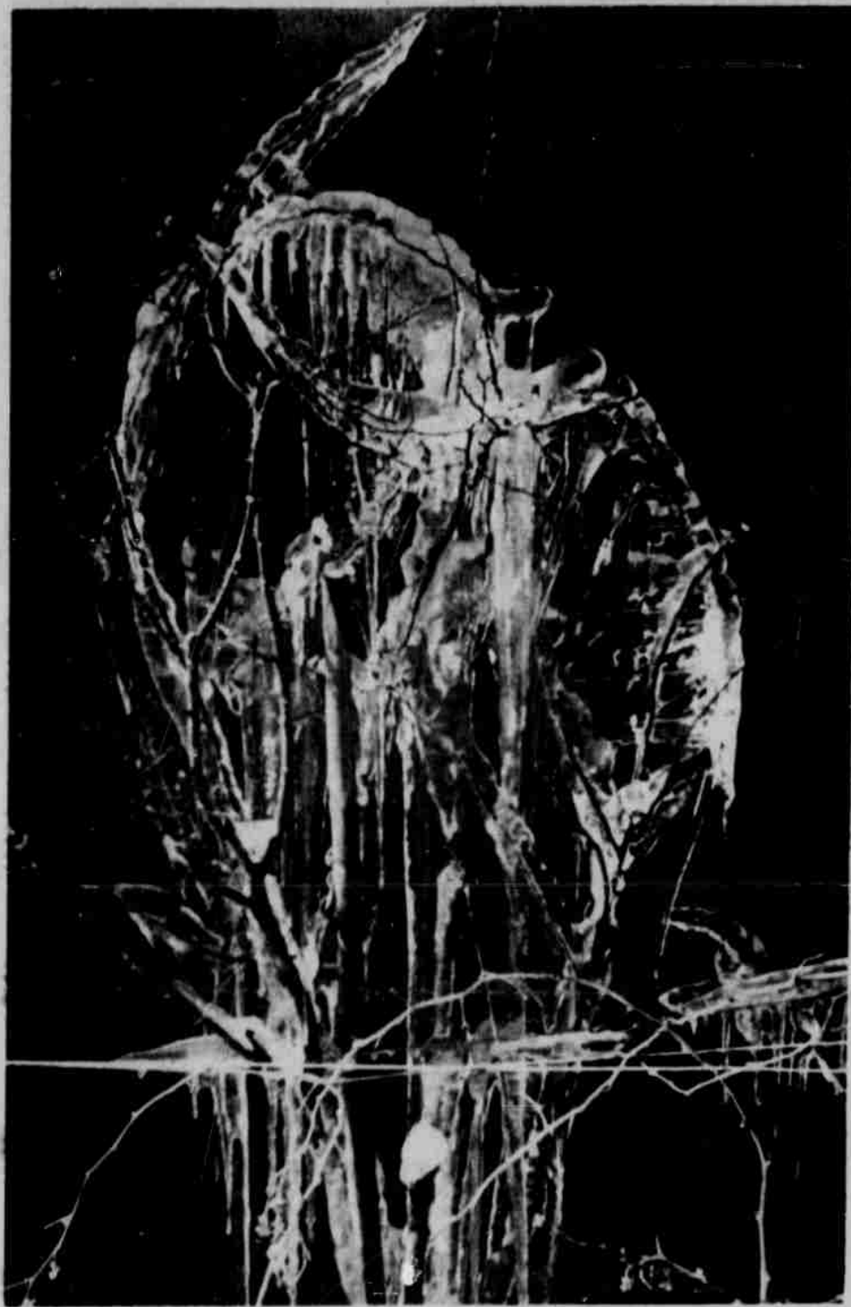
THE WEEK'S had weather produced icicles on this plant, forming a grotesque pattern.

allows twice the allowable load limit to pass over the structure. The council voted to notify school authorities and ask them to re-route the buses across the Riverside Street bridge. This new route, which is presently a one-way street, will have to serve traffic going in both directions, and school authorities should be allowed time to notify students of the existing hazard. In other business, the council accepted a new structure permit for the construction of a modular home with the (Continued on page 7)