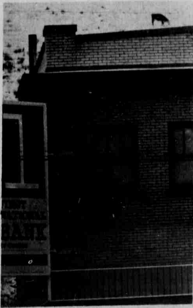
CATTLE ON THE BANK? Residents crossing Willow Creek on May Street take a "second take" these days when they see cattle browsing on top of the First National Bank Building. But it's an optical illusion. The cattle are grazing on a hill a quarter of a mile west of the bank.

value of $1,271 per acre. Other sales in the Blake Ranch addition, a recreational subdivision less than 10 miles from the Penland property, show an average appraisal of $1,622 per acre, well above the appraised value of the Penland property. In a recent letter to the corporation the Department of Revenue stated, "It is our opinion that the best evidence of the value of the property is the expert opinion and testimony of the county which supports the value of the roll. I therefore find the appeal must be denied." On Oct. 8, 1974, the State Real Estate Board approved the subdivision, as did the Department of Environmental Quality, provided disclosure statements be prepared for all prospective buyers.