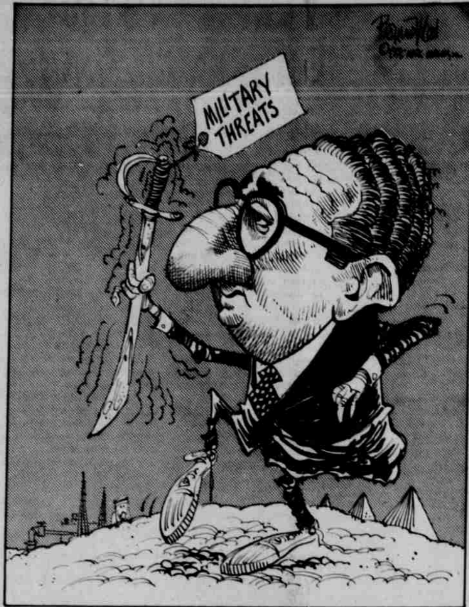
Walk Softly And Rattle A Small Sabre