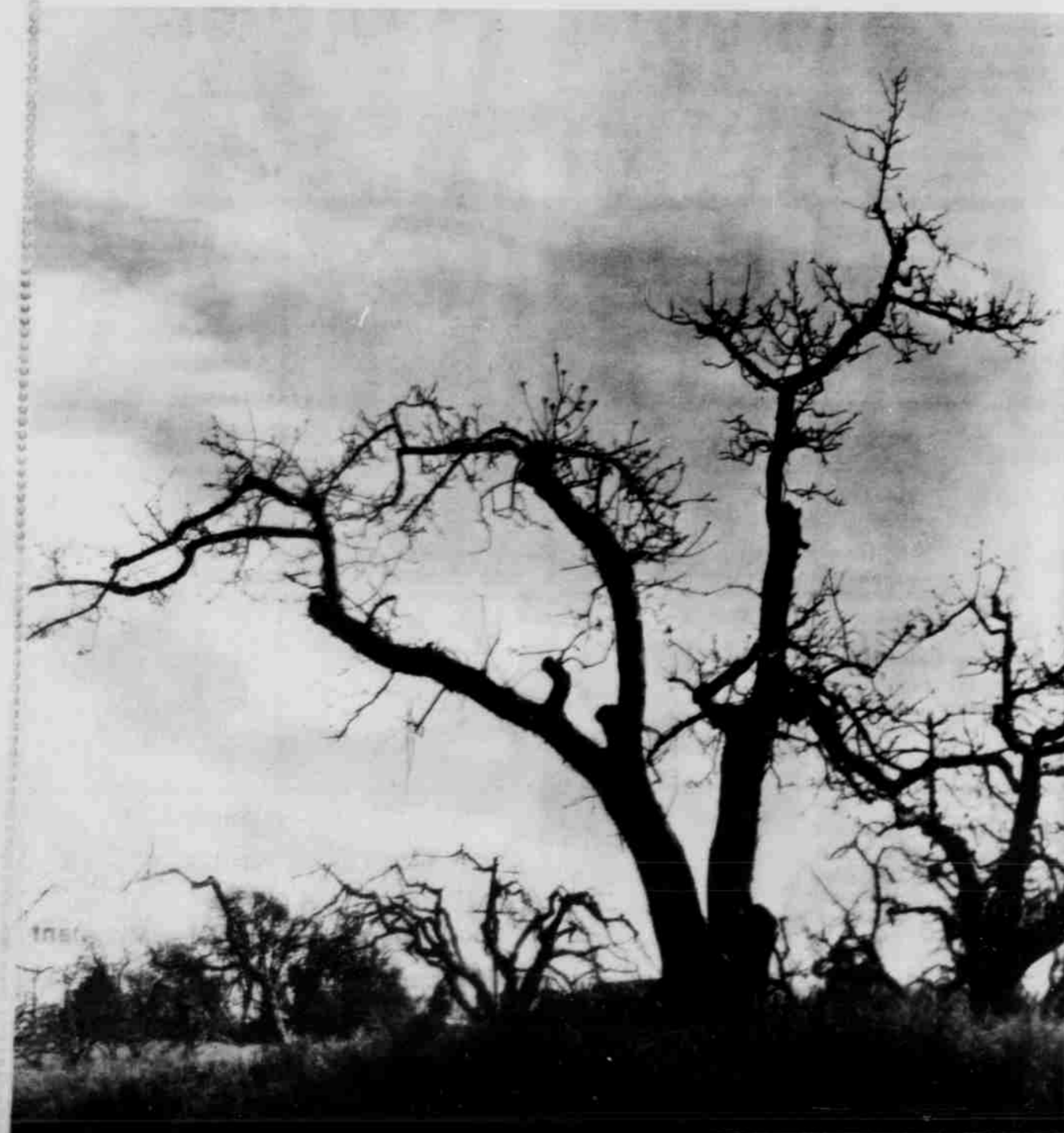
Winter arrives . . .

MEMBER, FEDERAL DEPOSIT INSURANCE CORPORATION