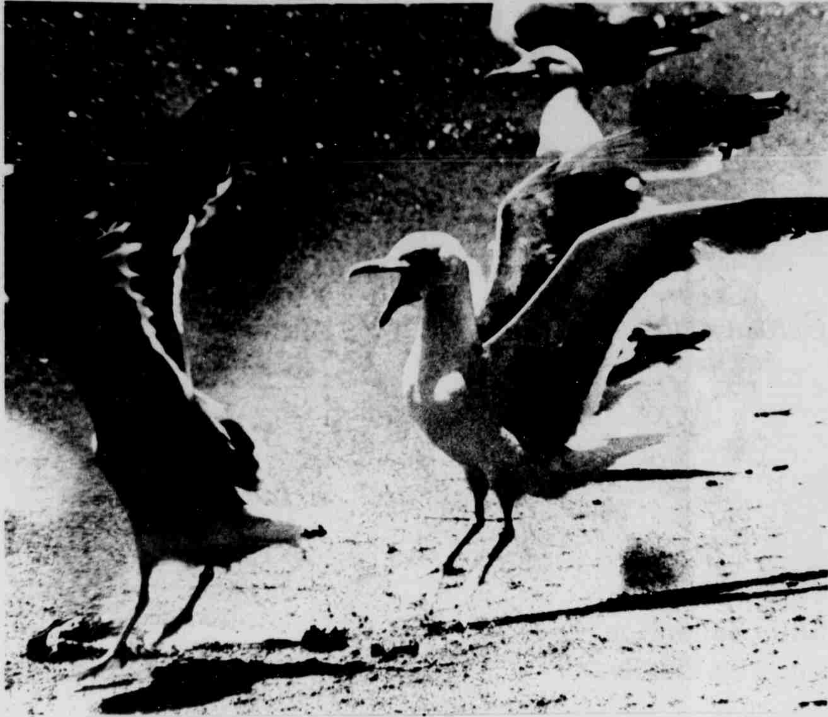
Quarreling seagulls along the Columbia River.