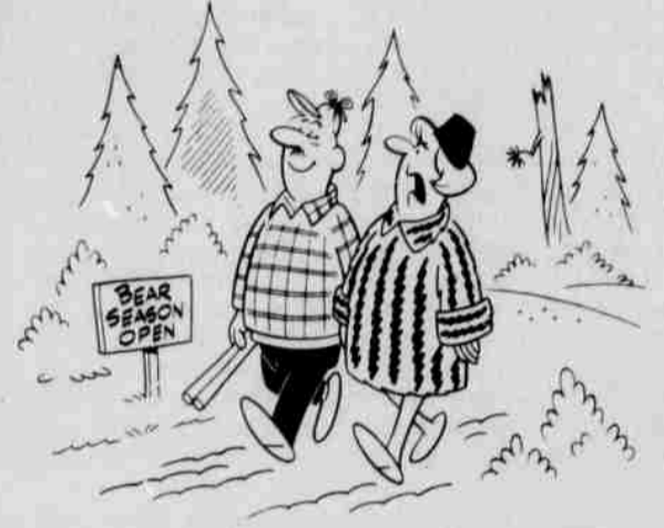
"I DON'T KNOW WHY YOU INSISTED I WEAR MY FUR COAT TODAY. IT ISN'T THAT COLD."