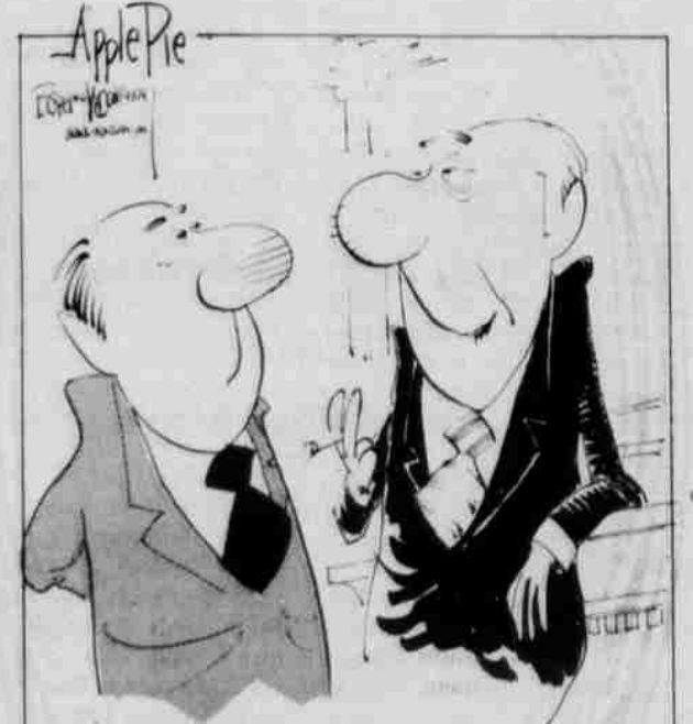
"Why Is It That When Nixon Says 'It's Profane' And 'Vulgar' But When Truman Said It It Was Just 'Earthy?'"