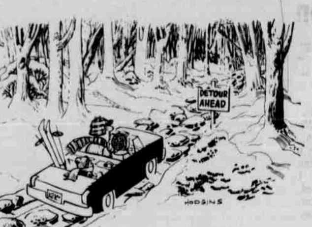
"Stop worrying... This car has four wheel drive!"