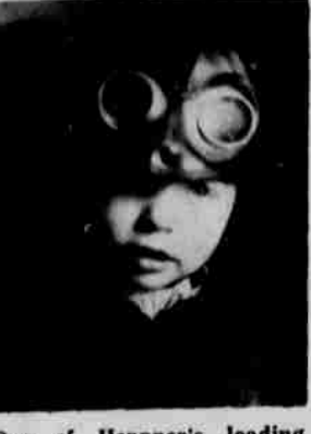
One of Hepner's leading citizens is shown here at the age of 3. The picture was taken on his birthday, Feb. 13, 1929, and it isn't hard to see that he's emulating the nation's hero, Charles Lindbergh, who made his historic New York to Paris solo flight two years earlier.