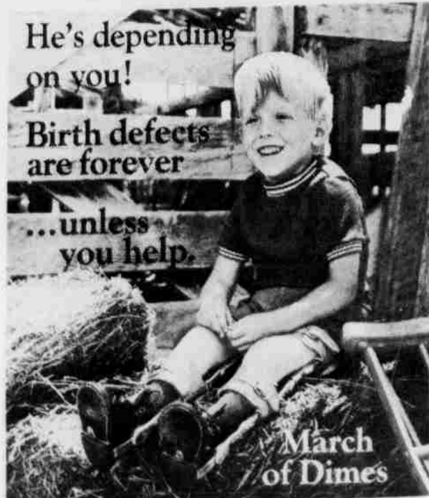
March of Dimes