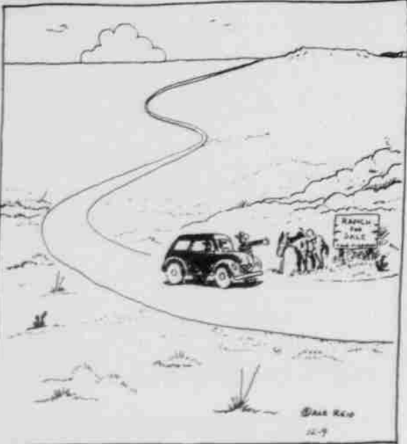
"Oh yes this here country's boomin', you fellers wouldn't believe it but when I first come here all this was good for wuz ranchin'!"