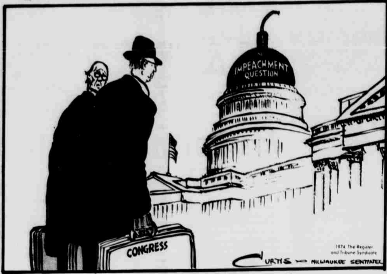
"I'm afraid it's not going to be an easy year!"