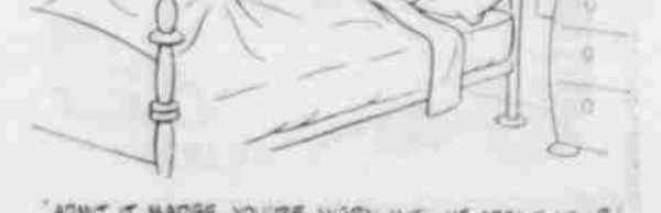
"ADMIT IT, MADGE, YOU'RE ANGRY WITH ME AREN'T YOU?"

This realization may be even more pronounced if the five lady deacons show up for the next of Moore's ordination services accompanied by that dignified, retiring and unobtrusive proponent of women's rights, the Honorable Bella ("The Hat") Abzug, Congresswoman from Manhattan.