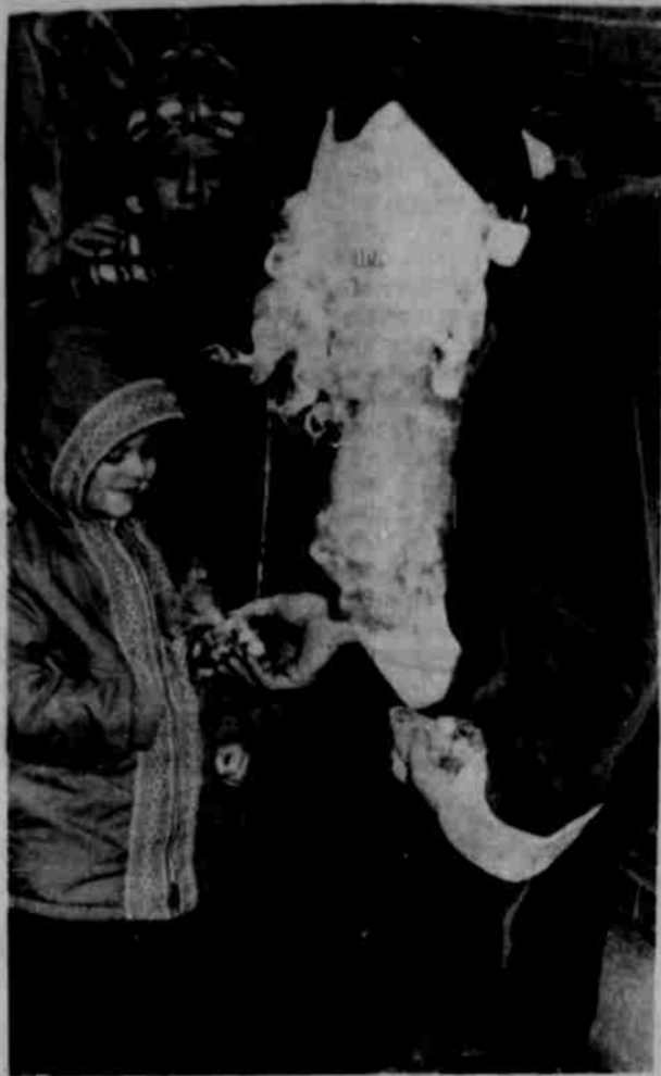
Santa Nick is having a hard time trying to convince this little girl to accept some candy. He had just arrived in Heppner Saturday after a long, fast ride from the North.

There will be a door charge of 25 cents per person to defray gas costs to gather the greenery. All materials and greenery will be available.