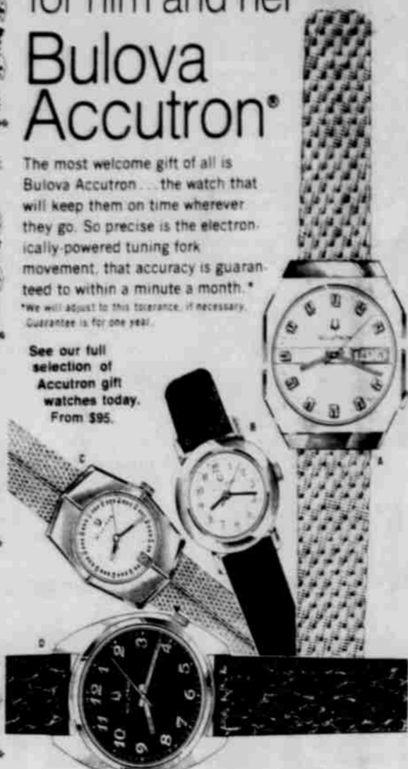
A. Unique angle-cut case, Champagne dial, adjustable mesh band. B. Stainless steel, silver dial, corium strap. C. Stainless steel, calendar, mesh bracelet. D. Stainless steel, moon-dial, leather grained strap.

See our full selection of Accutron gift watches today. From $95.