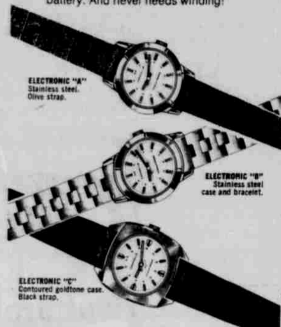
ELECTRONIC "A" Stainless steel, Olive strap.

It takes a fully electronic watch to keep pace with her new life style. A watch that goes wherever she goes, good looking and trouble free. She can depend on her Caravelle Electronic by Bulova because it depends on a reliable little transistor, an ingenious bit of electronic circuitry and a tiny long-life battery. And never needs winding!