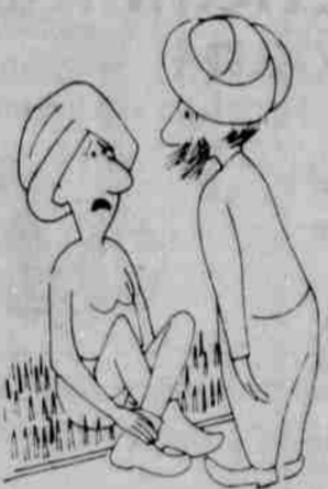
"I've got a nail in my shoe!"