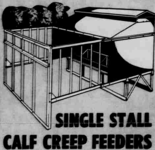
SINGLE STALL CALF CREEP FEEDERS

Clete grinned. "Truth will triumph," he said, "if'n it don't git run over by them instant environamintalists."