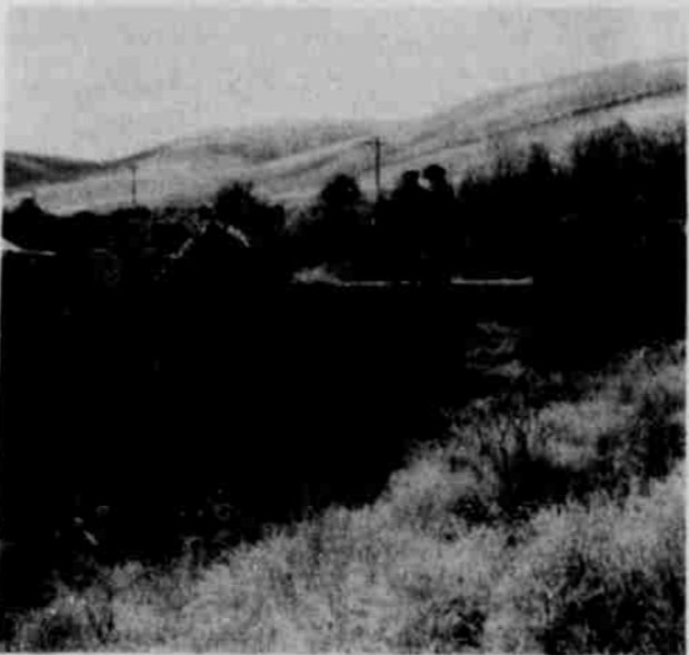
Balm Fork is the other possible site for the flash flood alarm system.