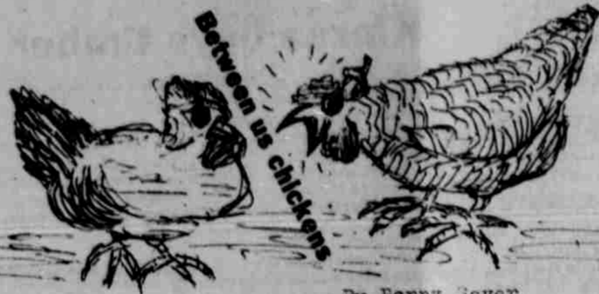
By Penny Saver

What Sally didn't know is that 10 minutes boiling destroys botulism anyway. If that much danger existed, a lot of us wouldn't be here today, because our grandmothers canned loads of beans with apparently few if any casualties. Actually, frozen beans are better, and the 15 minutes boiling before serving automatically eliminates any such problem. But, if you do not have a freezer, by all means can your beans, using proper sterilization methods. For freezing or canning fruit there is a new product on the market called Fruit-Fresh. You can drop the fruit as it is peeled, into water containing a few spoonfuls of the powder, and it doesn't discolor. For their free booklet, write Fruit-Fresh Recipe Offer, Dept. FF 73 Box 1467, Pittsburgh, Pa., 15230. Here is a simple but good recipe for pickles: Scrub, dry and pack 3-inch cucumbers closely in four 1-quart sterilized jars, with 1