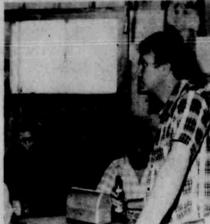
Senator Bob Packwood, right, listens to questions presented by workers at Kinzua Corporation. Packwood visited Heppner during Fair Week and addressed various groups in the area.