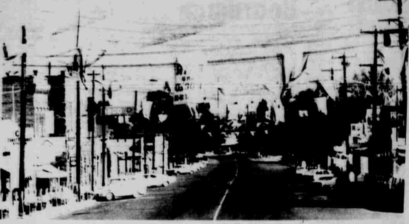
Looking North on Main St., Heppner can see banners for the fair and rodeo, perhaps for next year's fair and rodeo, the sign in foreground will be facing the right way.