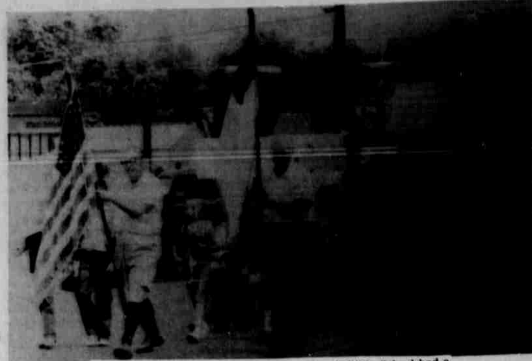
Children and teachers of the Three-Church Bible School had a parade last Saturday in downtown Heppner. There were approximately 90 children who participated in the parade.