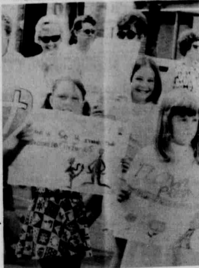
Advisors, teachers, parents, and children all took part in the parade, last Saturday. The parade was held in Main Street and all of the participants as well as the onlookers seemed to enjoy themselves.