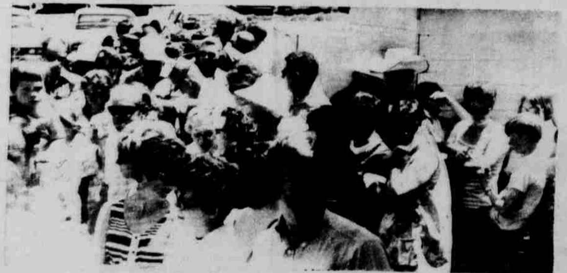
Lined up for the barbecue dinner

Features: Fish Pond, Children's Corner, Antique Alley, Silent Auction, Foods, Handmade Sewing, Arts & Crafts, New-to-you Items & General Merchandise.