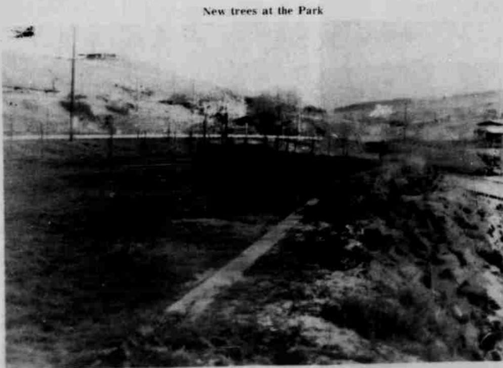
New trees at the Park