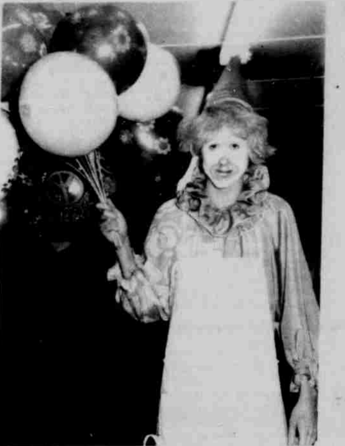
NO CARNIVAL IS COMPLETE without a clown and some fancy balloons.