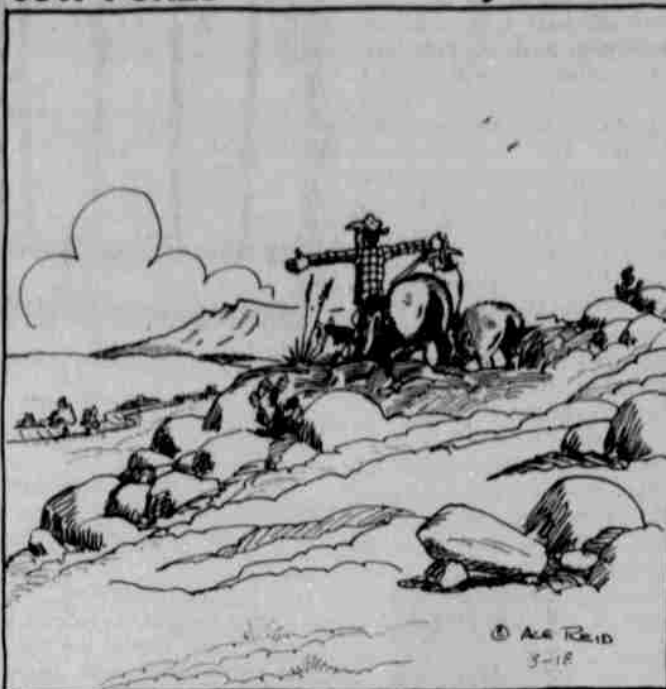
"To think, all this ranch is mine, 15,000 acres of land, no grass, five miles of creek, and no water"