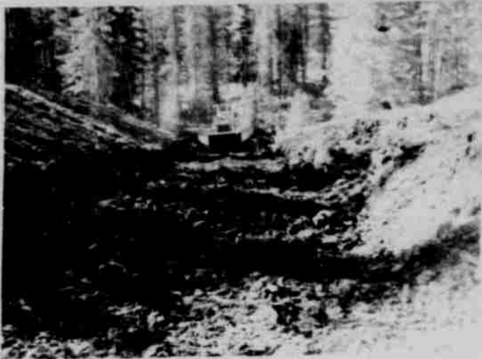
Outlet portion of emergency spillway during installing of riprap placement, Lake Penland.