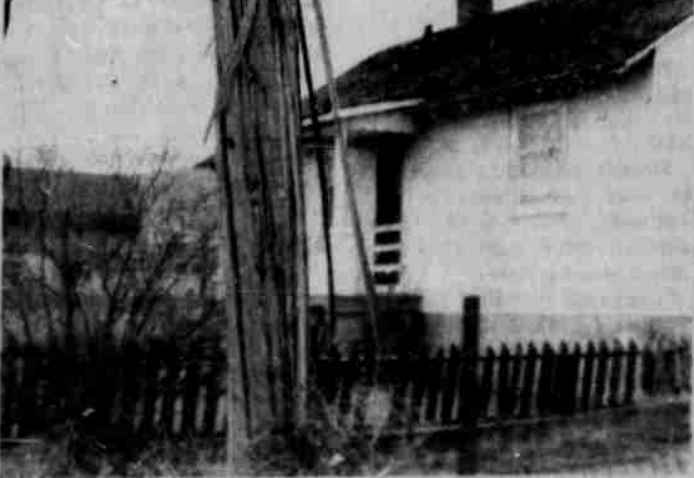
SPLINTERED TELEPHONE POLE