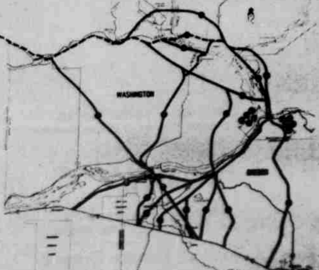
INTERSTATE ROUTE 82 CORRIDORS