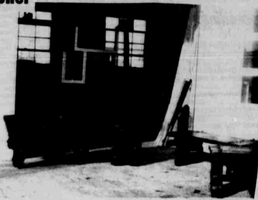
A group of Old World Furniture in front of the Cabinet Shop. In the background, a set of up-side-down Parsons tables may be seen.