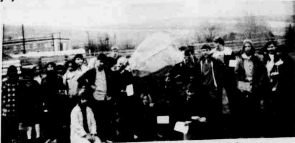
8TH GRADERS with the sun of their solar system which they placed at the football goal posts.