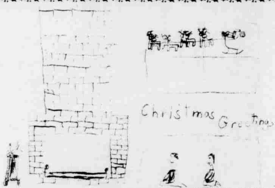
DRAWN BY TODD HARRISON