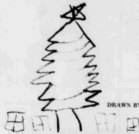
DRAWN BY ROXANNE HAYES