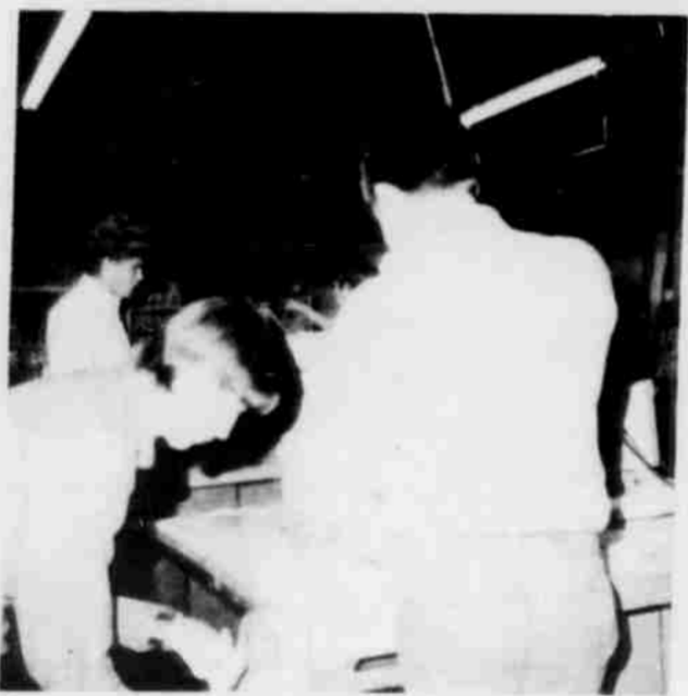
In a room 24x30 feet containing woodworking equipment does not leave adequate room for students to work on large shop projects. From the standpoint of safety, serious accidents can result from overcrowded conditions.

The woodworking shop classes are currently housed in a small 24' by 30' cement room under the gym. A room of this size containing the necessary woodworking equipment does not leave adequate room for students to work on large shop projects. The room also presents a problem from a standpoint of safety as serious accidents can result from overcrowded conditions in a room filled with dangerous equipment. Another serious problem is the lack of ventilation and the inability to clear the wood dust from the air. Storage areas are almost non-existent and make it difficult to store materials and projects.