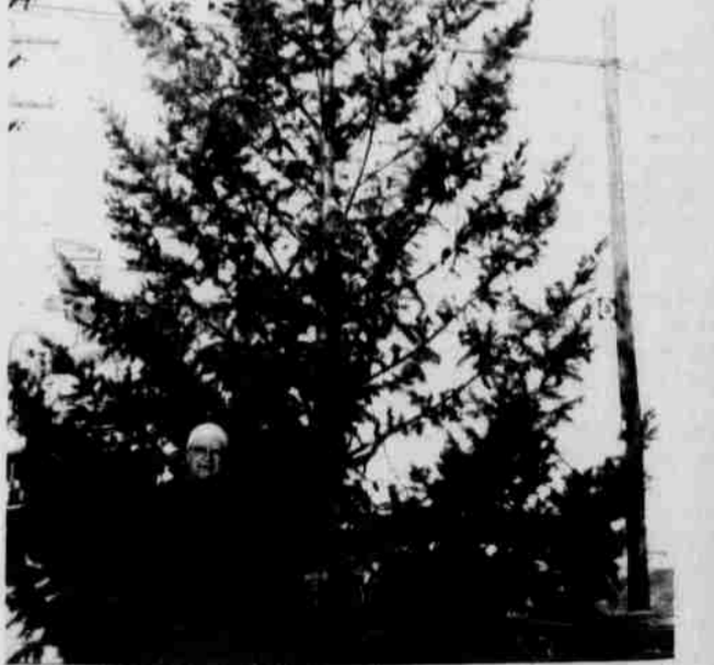
There's lots of beautiful brown fir cones on the community Christmas tree this year.

The Morrow County Jaycees Orange Sale has been postponed to Dec. 13. If the oranges are as good as the Jaycees sold last year, there will be many repeat customers to buy the oranges at $1.00 per bag. Proceeds will be used to purchase paint and other materials necessary to refurbish donated toys which will be given away in the Jaycee Christmas boxes.