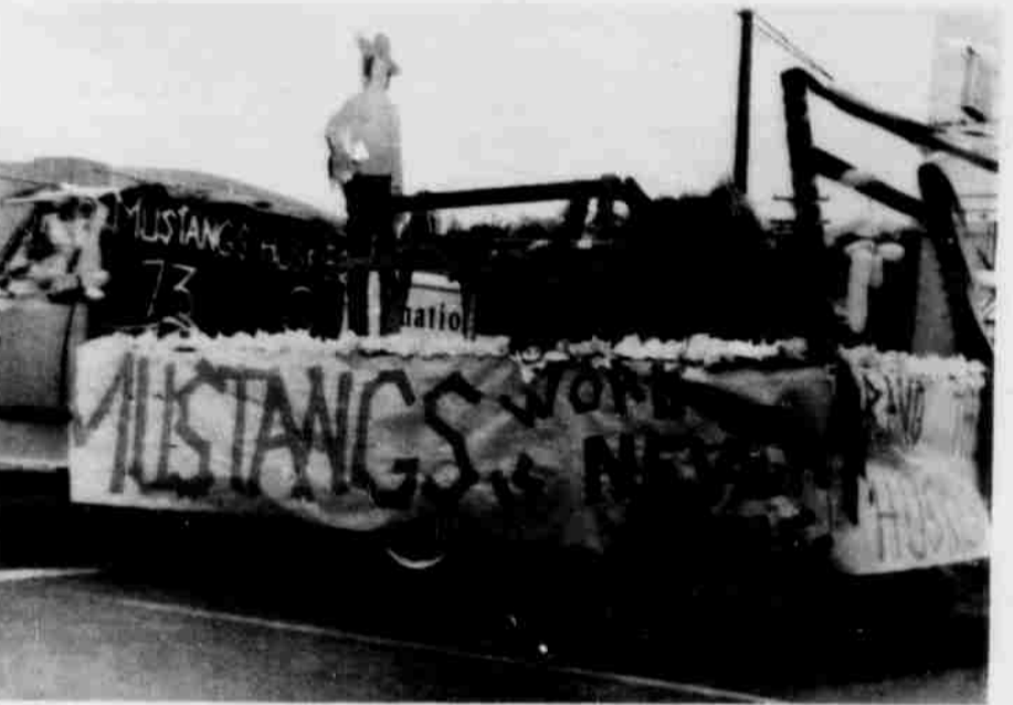
Seniors have a cowboy and his mustang in a western setting that included an over-sized brand M getting red hot over a fire. "Brand the Huskies". The seniors won 3rd place.