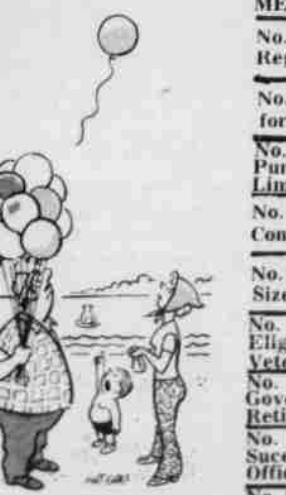
"I want that one."