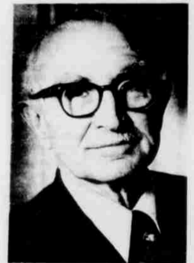
WAYNE MORSE For U. S. Senator THERE IS STILL MUCH TO DO