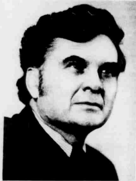
AL ULLMAN For Representative in Congress 2nd Congressional Dist. KNOWS THE PROBLEMS OF THE SECOND DISTRICT.