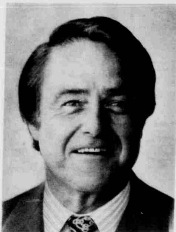
R. Sargent Shriver For Vice President of the United States