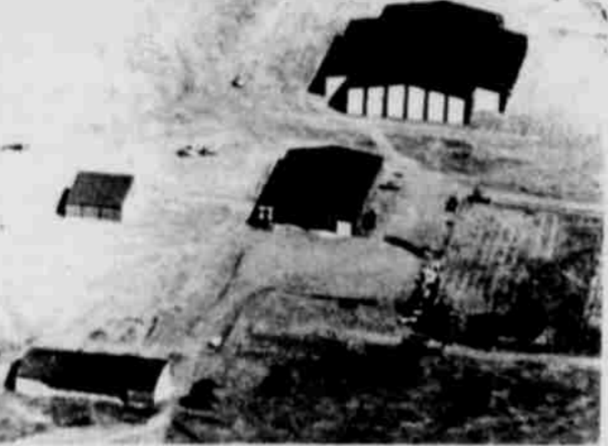
Oregon State University's new $450,000 Horse Center dedicated last Saturday.