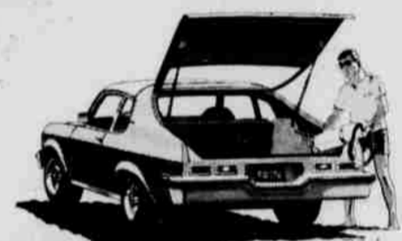
New Nova Hatchback Coupe.