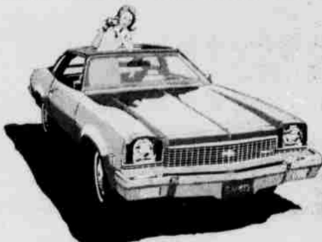
New Malibu Colonnade Hardtop Coupe.

It's standard on all big Chevrolet, Chevelle and Monte Carlo