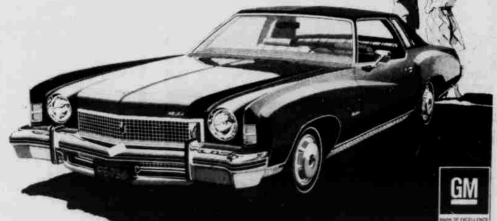
(below) Monte Carlo S Coupe. America's newest road car. With the handling of the finest European cars, and the looks and comfort of an American car.