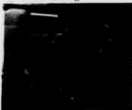
No hump, more legroom.

By the way, front drive eliminates the drive-line hump inside—so Toronado's front floor is flat. So you enjoy an extra margin of comfort.