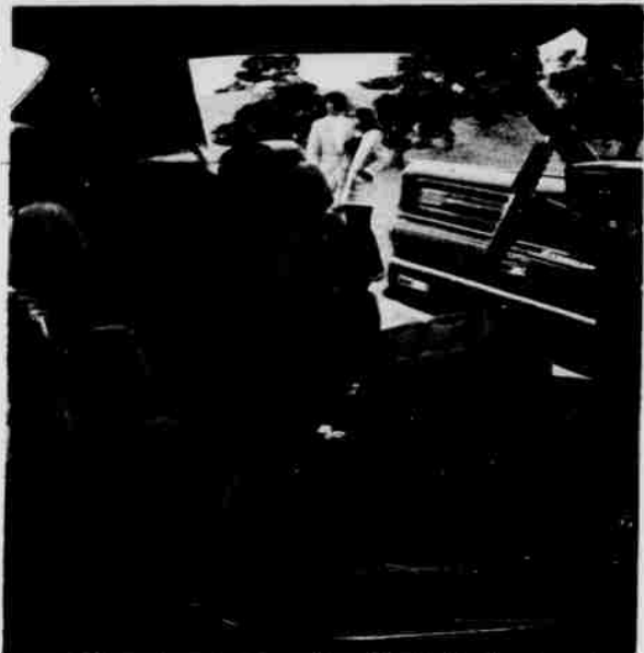
Special Brougham interior offers this divided front seat.

And when you come to drive it for the first time, you'll understand why it