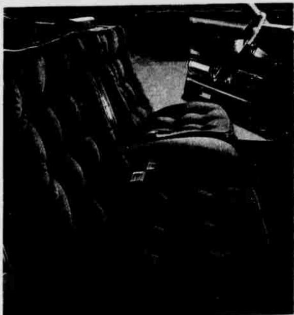
This Regency upholstery is a distinctive limousine-quality velour, one of five choices.

You can again choose the Luxury Sedan or Coupe, or the regular Ninety-Eight hardtop sedan, or hardtop coupe. All have the new hydraulic front bumper system, and a new, stronger rear bumper. And all, in their quiet way,