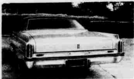
For 1973, rear bumper guards are standard.

Last year, Olds introduced the Regency as a special limited-edition model, to celebrate its 75th Anniversary. Now it's a regular part of the Ninety-Eight line—with its own special elegance, luxury and comfort.