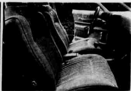
New Cutlass Salon—Oldsmobile's own 4-place, 4-door road car in the grand touring tradition. Both contoured front seats recline.