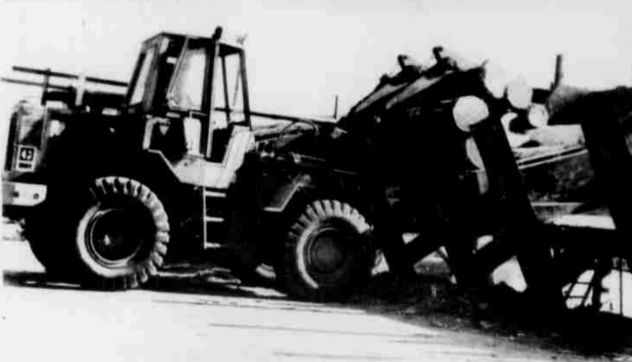
OUT OF THE STORAGE BIN to the Steam vat Doug Dubuque expertly picks up a load with the Caterpillar No. 930 fork lift.