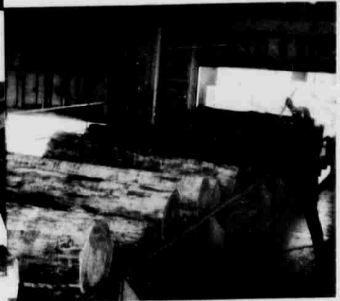
FROM THE STEAM VAT on to the infeed deck of the Lathe.