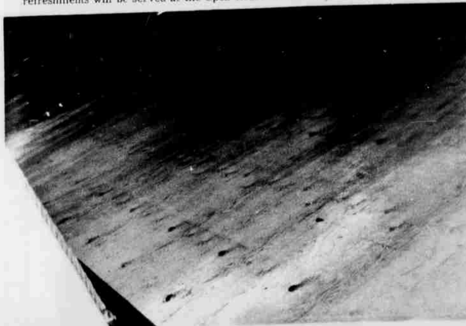
L-O-N-G sheet of veneer is peeled from the log in the lathe and is on its way to the clipper.