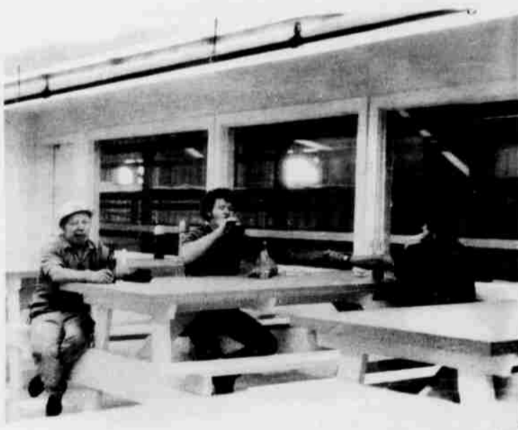
ORANGE AND BRIGHT is the lunch room where the refreshments will be served at the Open House on Saturday.