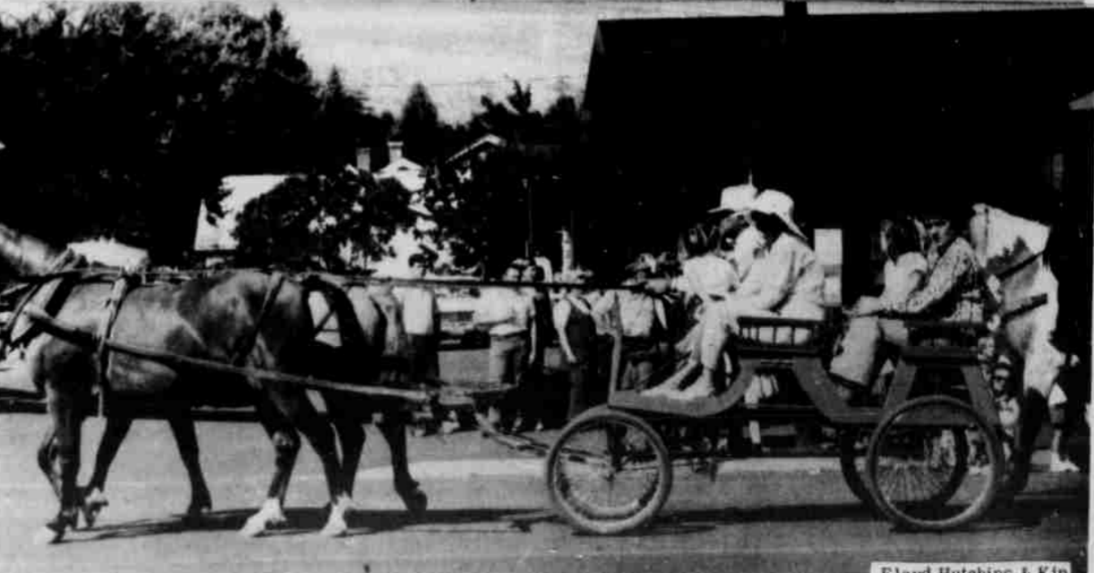
Floyd Hutchins & Kin