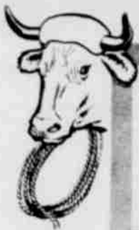
"Here's how it is done!"