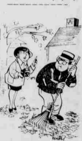
"Turn around and scowl!"

A bum approached a man and asked for a dime. The man told him he didn't have a dime but he'd be glad to buy his breakfast. "Man" the bum said, "I've had three breakfasts now, trying to get a dime."