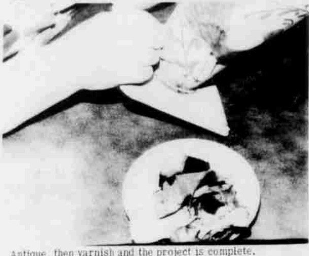
Antique, then varnish and the project is complete.

The projects have ranged from new and old boards, stools, boxes, cans, bottles, canisters and bowls, to kraut boards, coffee pots, milk cans, clocks, and watering cans. "Something we paint makes a good gift because it is home-made," the women say. Many of the items they