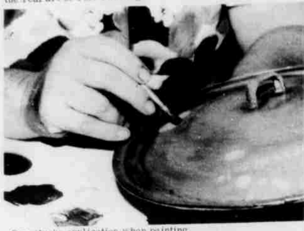
One-stroke application when painting.