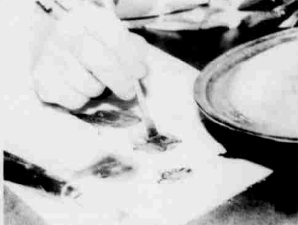
Getting more than one color on a brush at one time is the real art of Tole Painting.