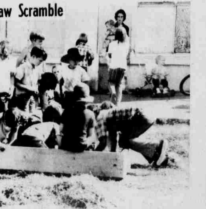
THIRTY DOLLARS in pennies, nickels and a few quarters were tossed in the straw during the Sidewalk Bazaar last Friday and Saturday. Money was contributed by Elmas Apparel, Murrays Drug, Mi-Ladies and Gontys Shoes. A shot of eager hunters is typical of much of the two days. "Gold is where you find it!"