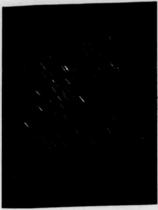
A BIG CROWD gathered to see the annual Fireworks at lone Saturday night. This is a black and white one of the beautiful bursts.