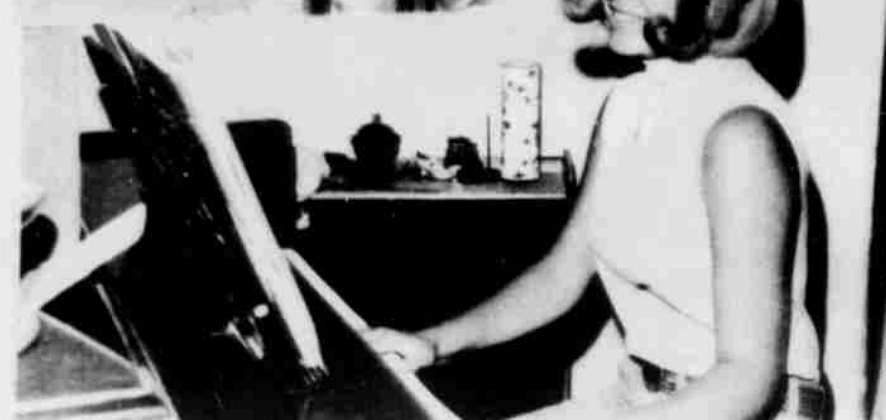
Playing the piano for her own amusement.