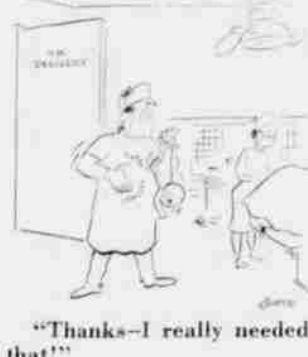
"Thanks—I really needed that!"