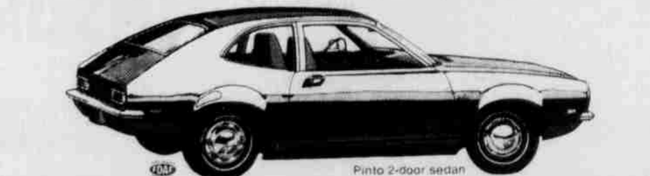
*Based on a comparison of sticker prices for base 2-door models. Optional white sidewalls, plus dealer prep and destination charges. If any title and taxes, are extra.

Nobody beats the Northwest Ford Team: 1st in sales, 1st in service, 1st in customer satisfaction