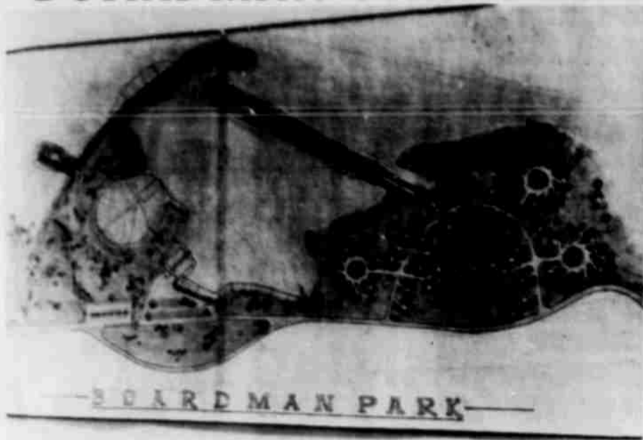
THE ARTIST'S conception of the Boardman Marine Park. The left shows the city well then the swimming basin, the "inner harbor" on the shoreline can be seen the two boat launching ramps. On the right are the overnight parking spaces.